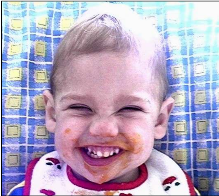
Past OHSU research study participants.