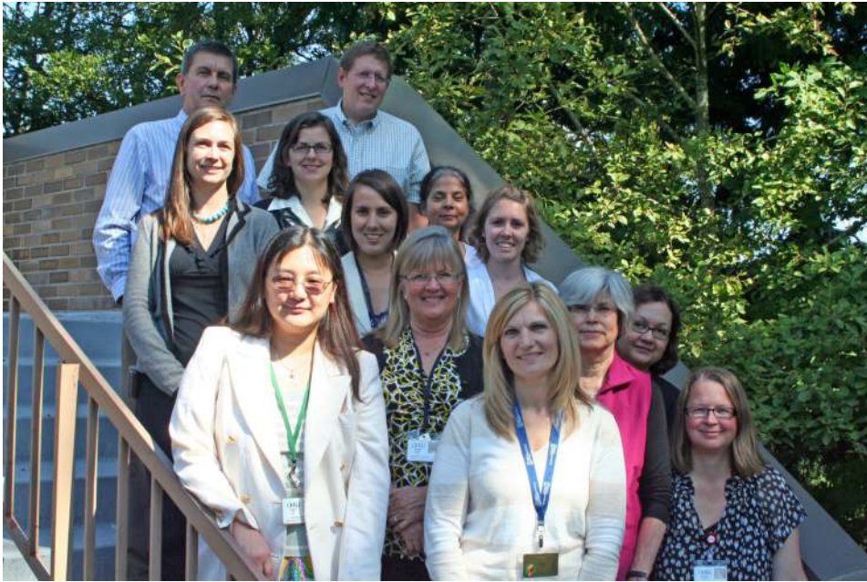
Above: OHSU STAIR research team.